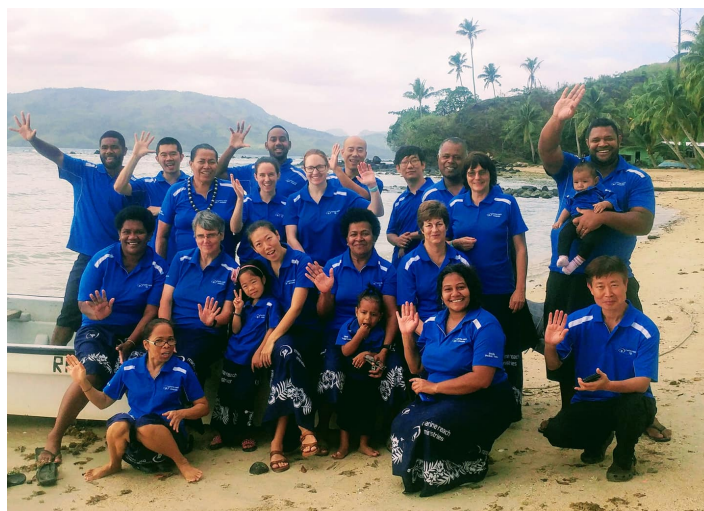
The Outreach team on Namuiamada beach